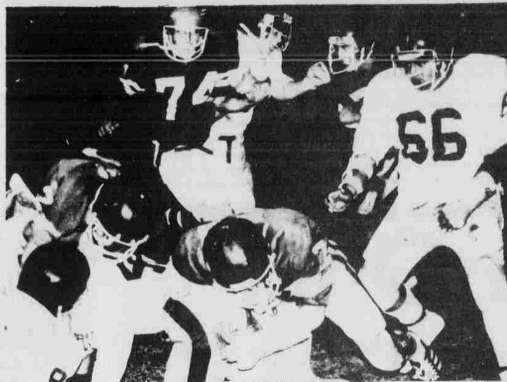
The Heppner Mustang defensive unit stopped an offensive push Friday night by the Stanfield Tigers and shut them off from scoring, 0-20 in the season opener for both schools. The Mustangs see action Friday night against Riverside High School at Boardman.

forced to punt only once during the contest when Jim Parker booted the ball 41 yards. Murray led the rushing