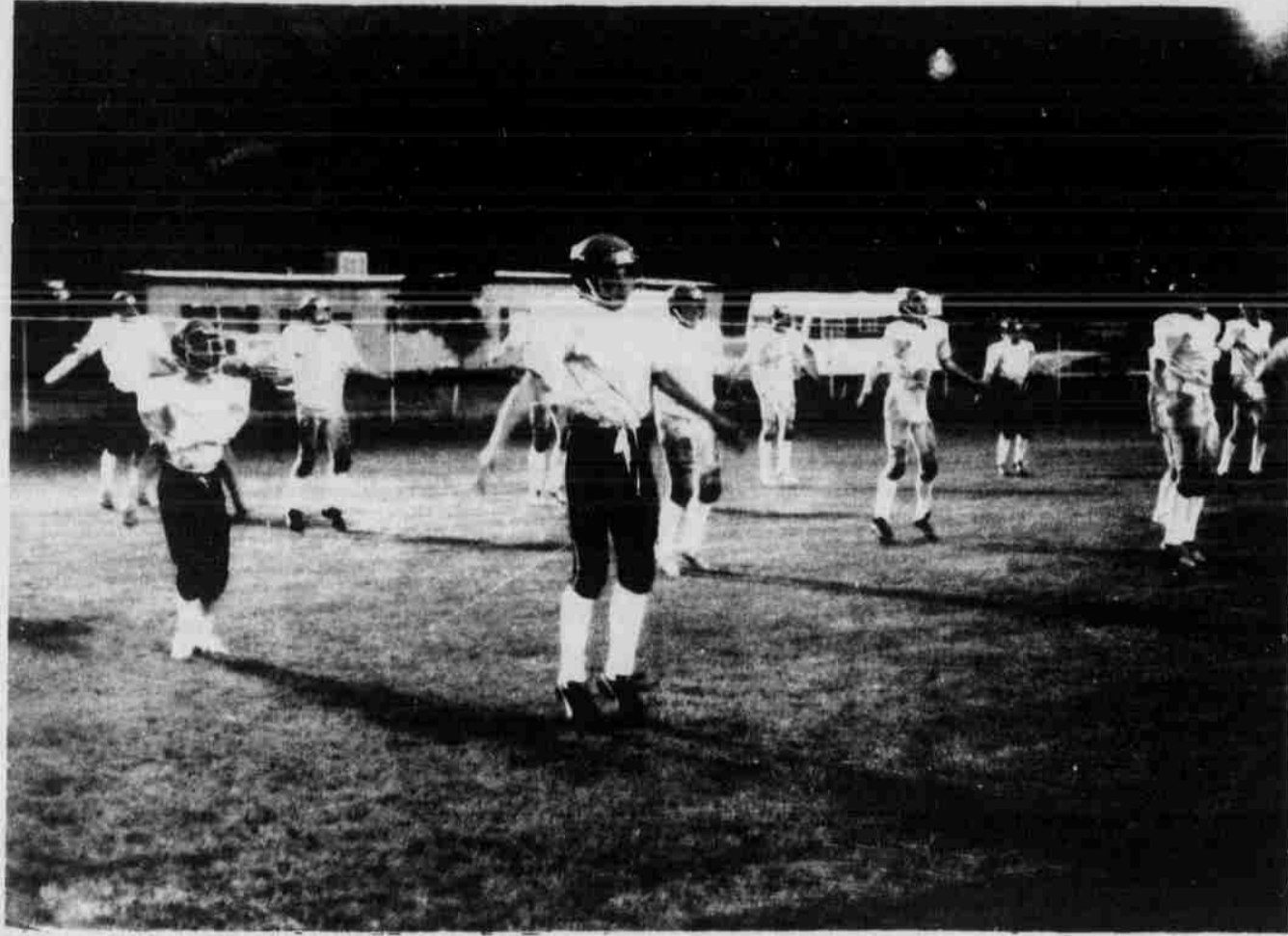
Cardinals practice for season opener Friday