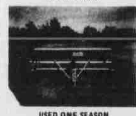
USED ONE SEASON

Tractors FD 14A International Crawler with Holt Hy. Angle Blade JD 2010 Diesel JD 720 Diesel JD Model B