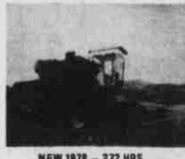
NEW 1978 - 272 HRS.