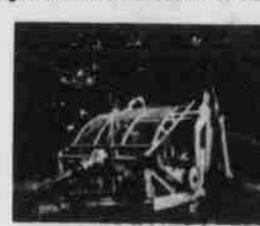
ANDERSON PTO ROCK PICKER

75 Dodge 3/4 Ton 4x4 Pick-up—39,000 miles