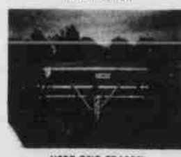
USED ONE SEASON