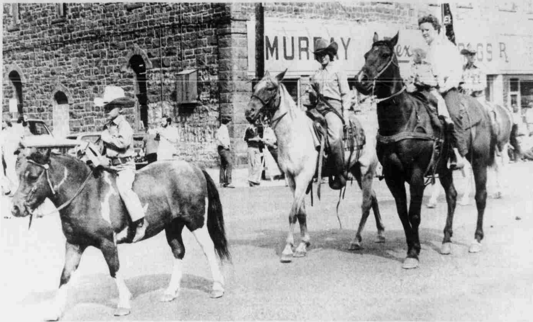
Family entries were typical of Saturday's Rodeo Show Parade in Heppner and many of the riders carried youngsters in their laps down Main Street. The youngest cowboy was 7 months old.