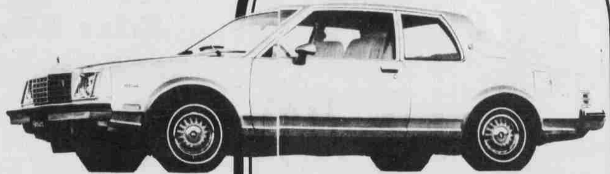
1980 Buick Skylark