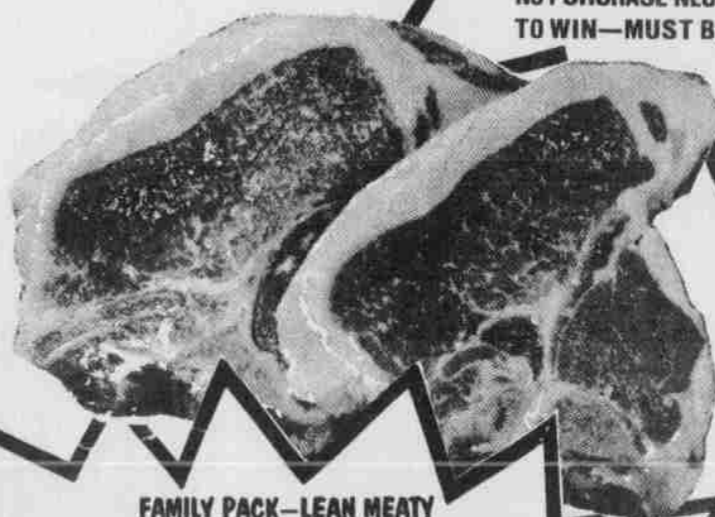
FAMILY PACK—LEAN MEATY