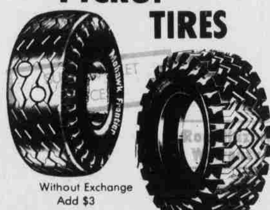
Without Exchange Add $3