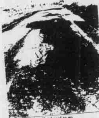
Hard road to go

The Heppner GAZETTE-TIMES Morrow County's Award-Winning Weekly Newspaper