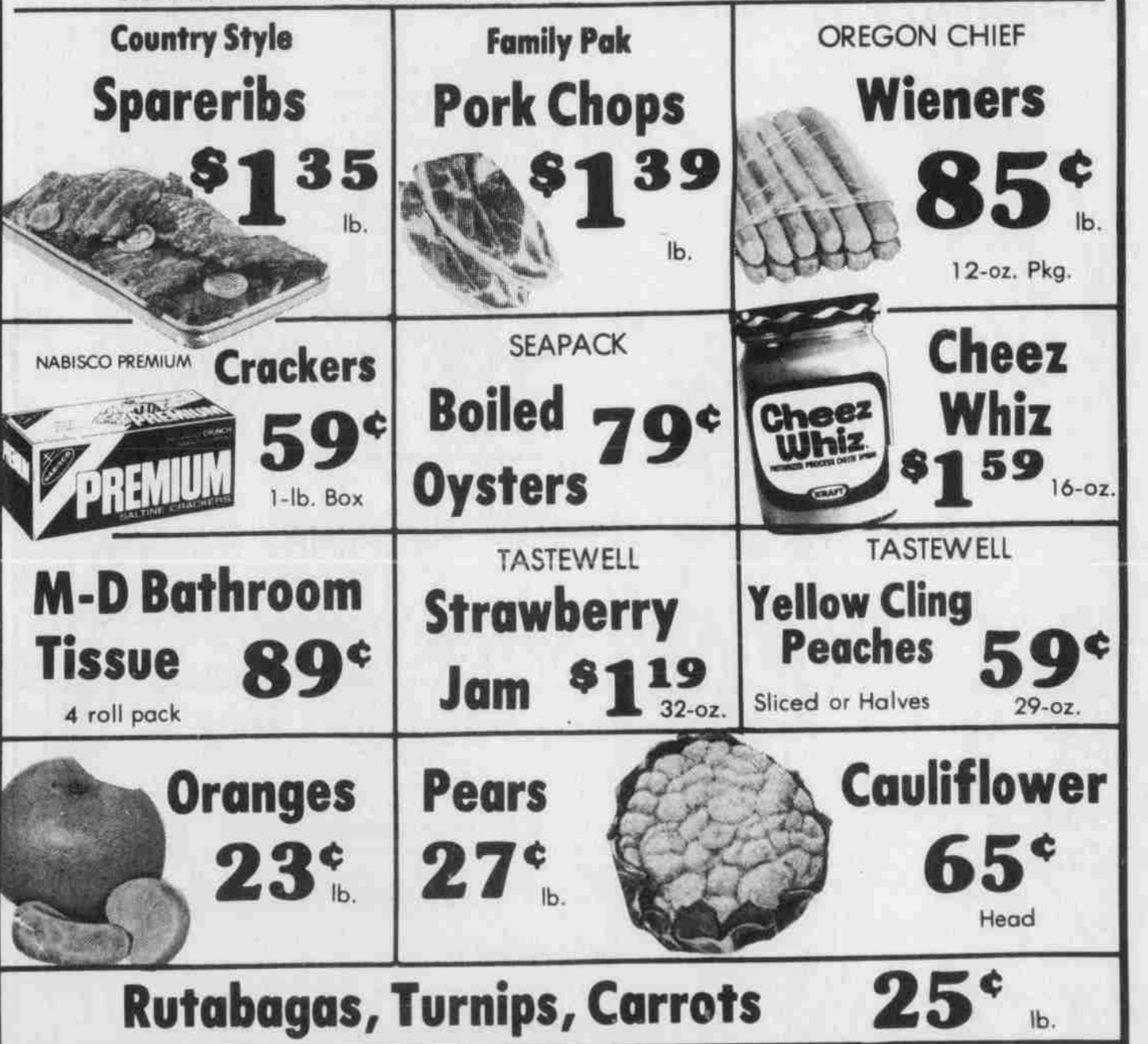
FIGURE SAVINGS WHEN YOU FOOD SHOP HERE