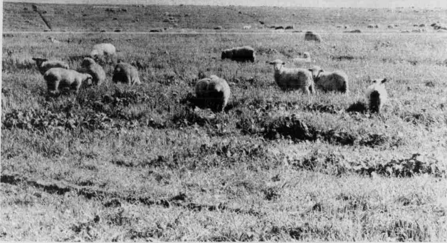
Sheep graze on late crop of turnips seeded into harvested wheatland on Morrow County's Far West Farms. The turnip crop ripens after wheat has been harvested from irrigated land, producing hundreds of pounds of valuable mutton per acre from land that would ordinarily lie dormant. The turnips were seeded by airplane. Sheep quickly learn to dig the savory roots from the ground.