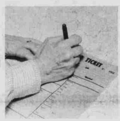
From determining your needs

The Heppner GAZETTE-TIMES Printers & Publishers 676-9228