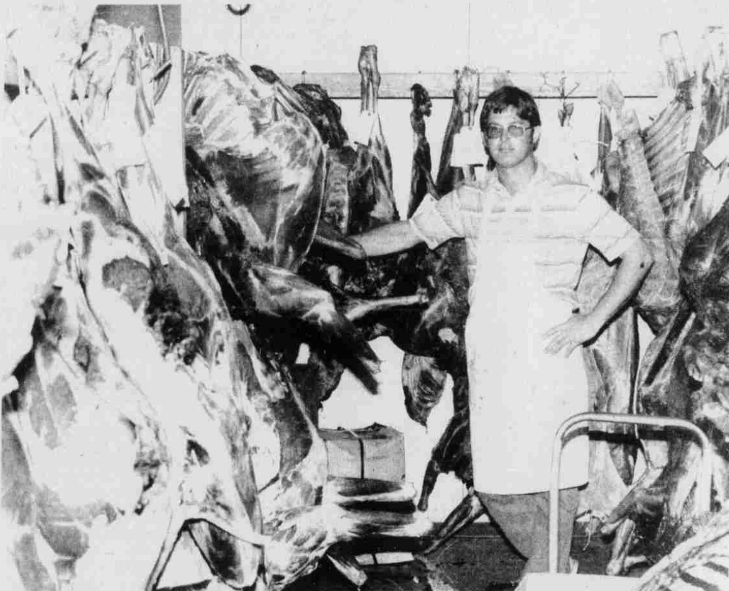
The buck stops here