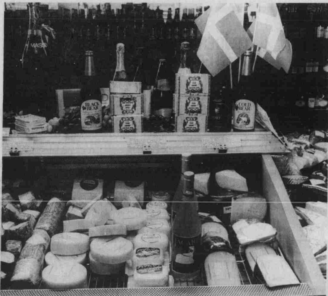
MEAD'S THRIFTWAY FEATURES a complete wine and cheese cellar with an ample selection of the finest, most popular imported cheeses. Select from robust to the nutty, delicate flavors of the world's quality cheeses. Add this to a bottle of fine wine chosen from our wine cellar to accent your next meal.