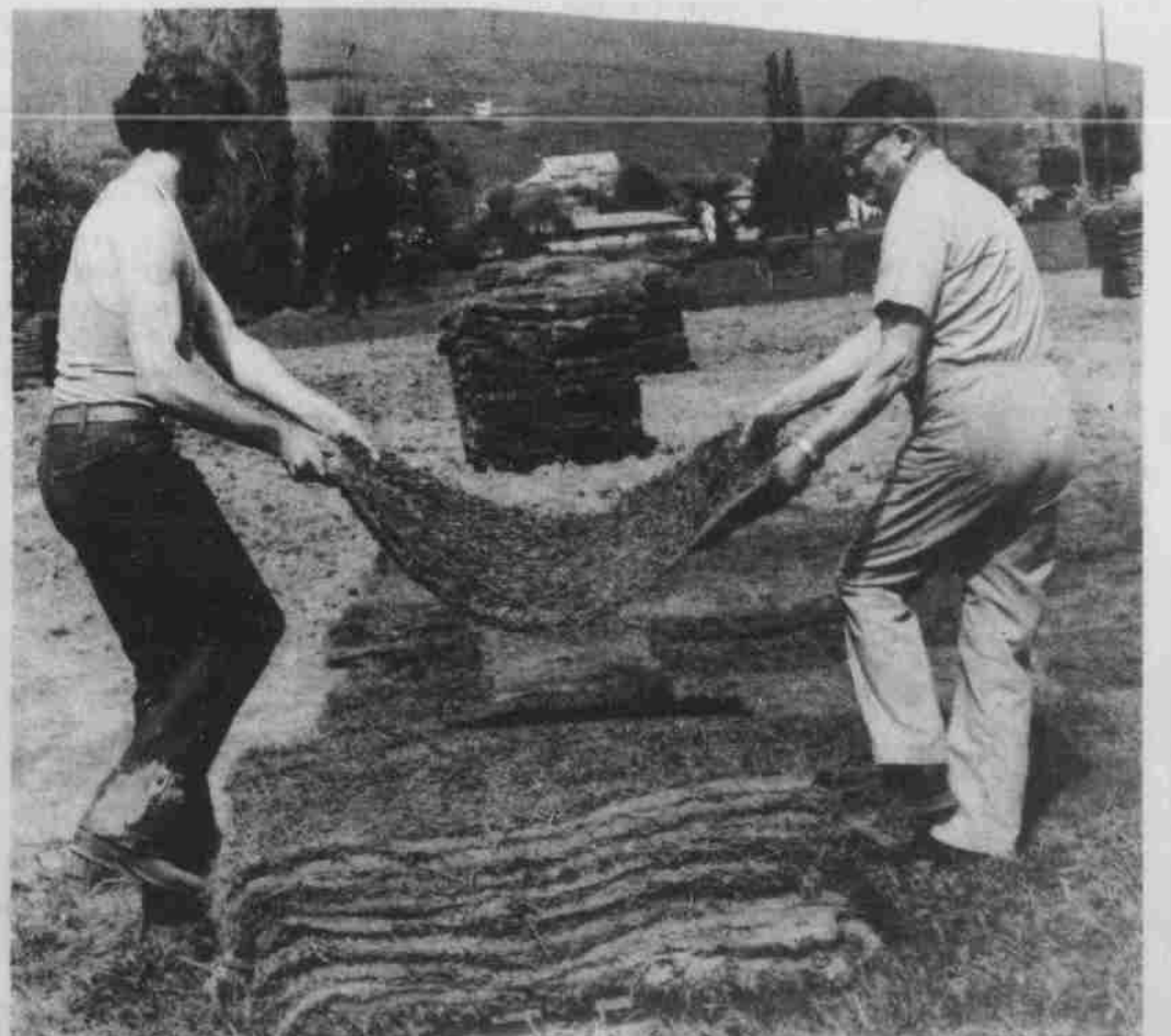
Instant park ....

With the community behind the Hager Park project, Heppner should be the home of a healthy green space on the banks of Willow Creek in time to beat the summer heat.