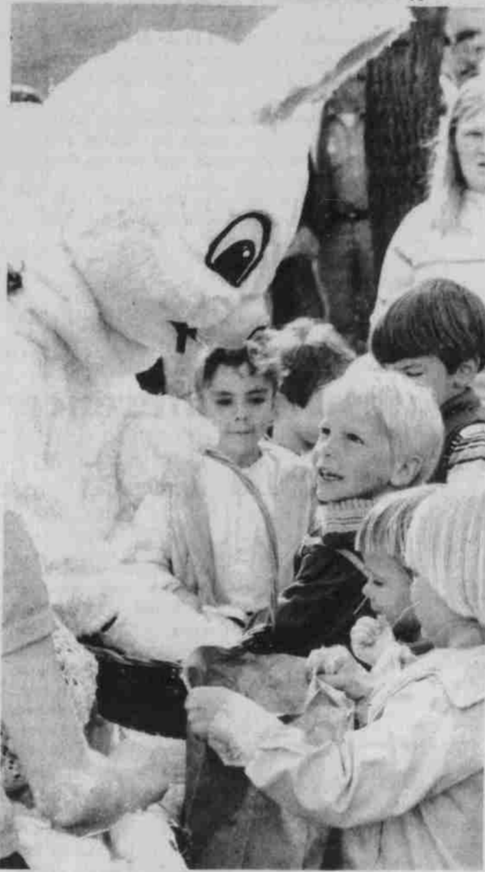
The Easter Bunny was mobbed by delighted pre-schoolers as he passed out Easter candy at the Elks sponsored Easter Egg Hunt in Heppner City Park last Saturday morning.