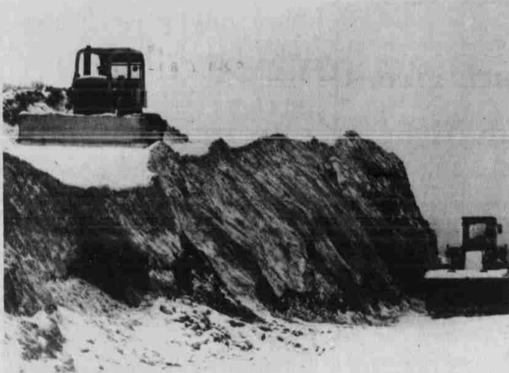
The State Highway Department is knocking off one of the corners between Lexington and Ione for rock that will be used on a project further down the road. Please see accompanying story.