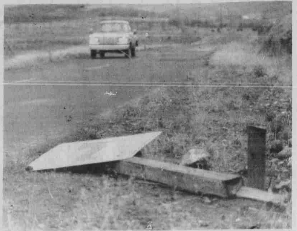
Sign of the times

The Heppner Ranger District will be open Saturday, December 10 between 8 a.m. and 2 p.m.; the Pomeroy Ranger District on December 3, 10, 17 between 9 a.m. and 2 p.m.; and the Supervisor's Office on December 3, 10, 17 between 8 a.m. and 3 p.m.