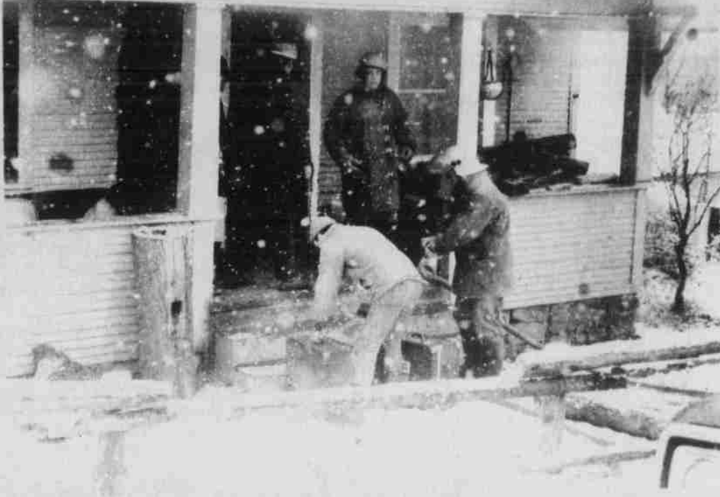
Heppner volunteer firemen don air masks before entering a smoke-filled house. A faulty flue was blamed for the fire on Aiken Street last Friday.