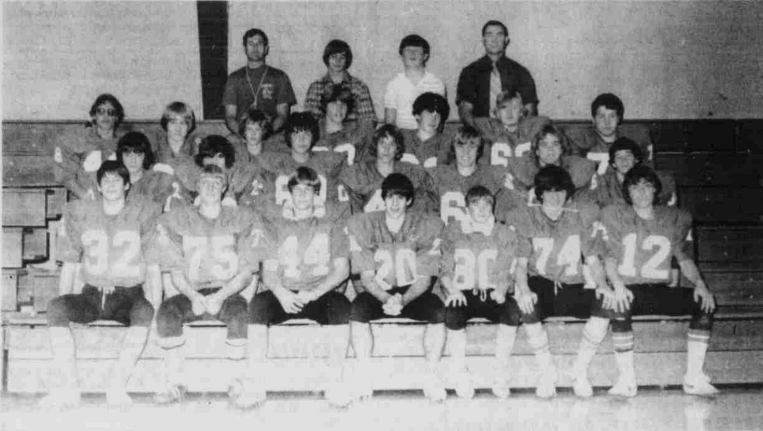
The 1977 Lone Cardinals