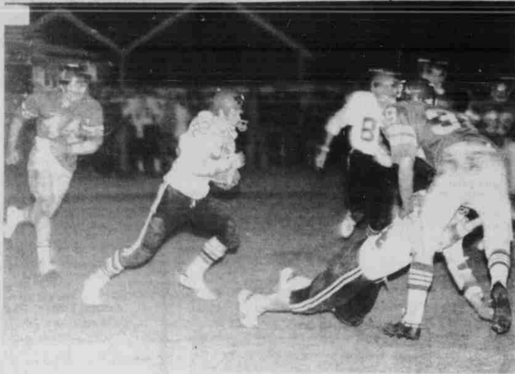
Here I come...