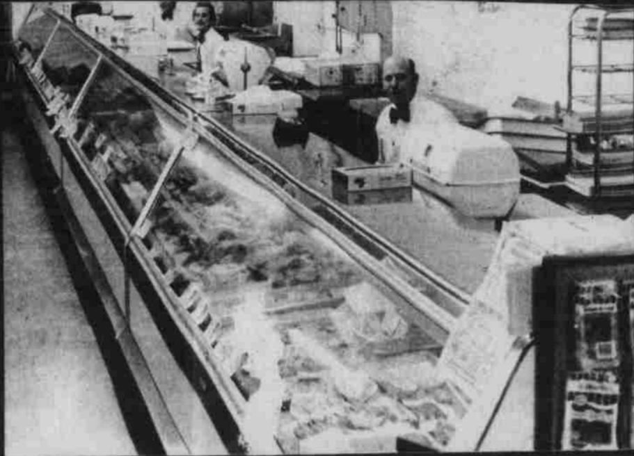
FRESH WHOLE BODY

We Feature Eastern Oregon Grain Fed Beef And We're Proud Of It