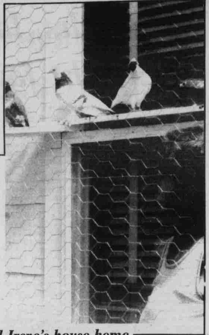
All kinds of pigeons call Irene's house home