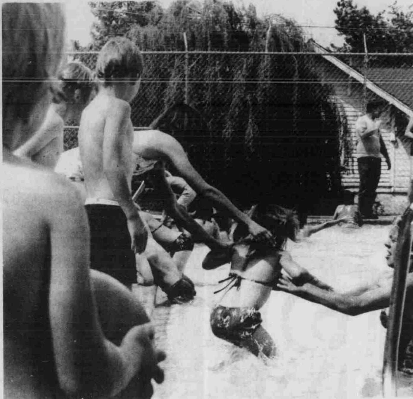
There's no doubt Heppner area youth are glad the City Council and concerned citizens got together and worked out a solution for keeping the pool open. The Heppner Lions Club raised enough money to satisfy city needs and at a budget meeting Monday evening