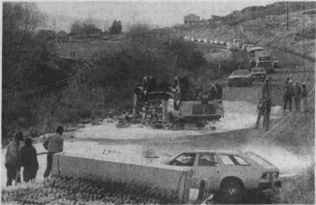
Two persons escaped serious injury in this collision on Highway 74 west of Heppner Thursday evening, April 14. Car at right collided with the overturned truck. Impact at the truck gas tank spread gasoline across the road. Firemen cleaned up and a 930 log loader from Kinzua Corporation set the truck upright, cutting more than one hour from a traffic jam which completely bottled traffic for 45 minutes.

There were no contests in any of the county cemetery and fire protection districts.