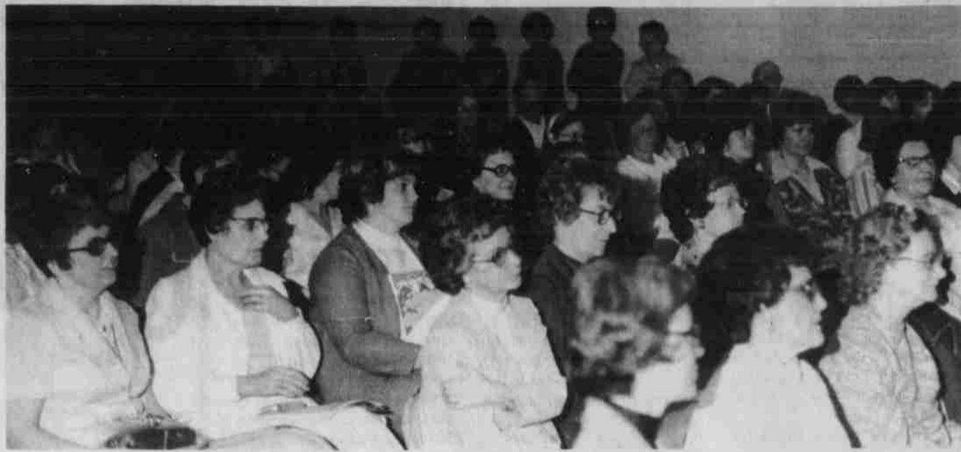
More than 100 persons participated in a program on wheat products in Heppner April 4. Part of the attentive crowd is shown here viewing demonstrations planned by Morrow County Wheathearts, Morrow County Extension Service and the Oregon Wheat Commission.

'Getting your breads together' program termed success