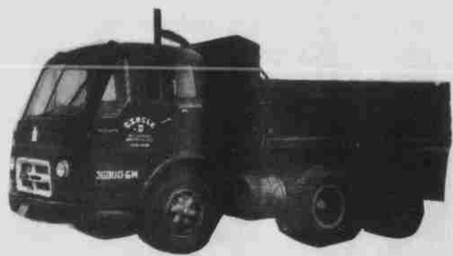
8 Yrd. DUMP TRUCK