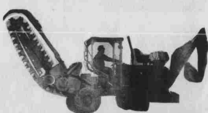
VERMEER TRENCHER 14" wide x 5' deep, with backhoe 9' reach, 18" wide bucket, hydraulic angle tilt dozer blade.