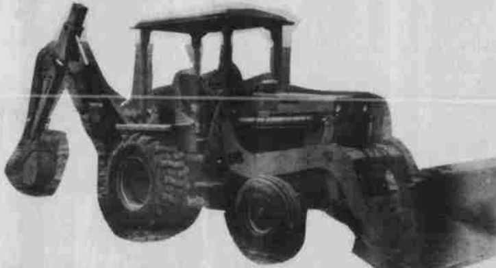
680 CASE BACKHOE with 16 ft. reach; a 1 yrd. front end loader, buckets 18" and 30". 7 TON MACHINE—Powerful enough for the toughest digging.