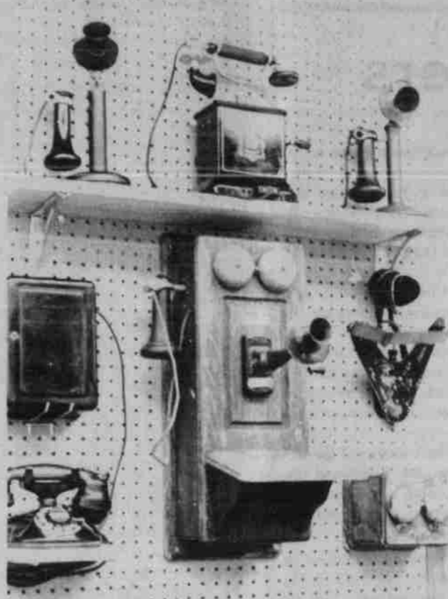
A new display of old fashioned telephones is ready for viewing now at the Morrow County Museum in Heppner.