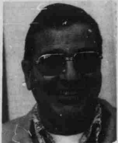
Lyle Cox Petroleum & Hardware