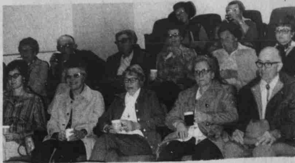
Some of the group

After our jewelry and money was returned to us, we boarded an electric bus with a very personable guide who explained the steam generators, nuclear fuel, the high pressure turbines, and cooling systems. We also viewed the computer room that runs the plant.