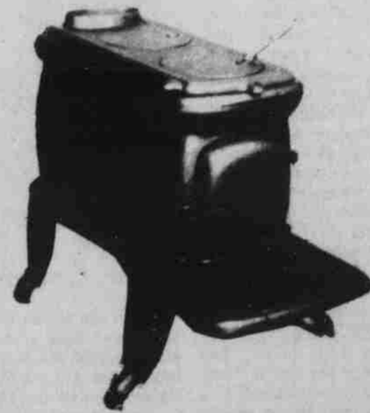
Box Heater 27 Inches