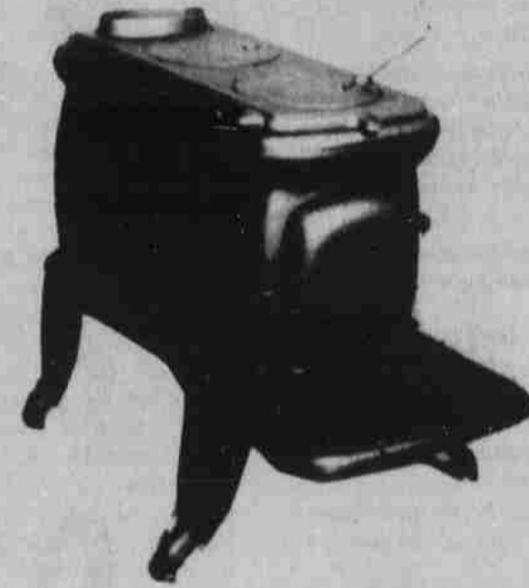
Box Heater 27 Inches