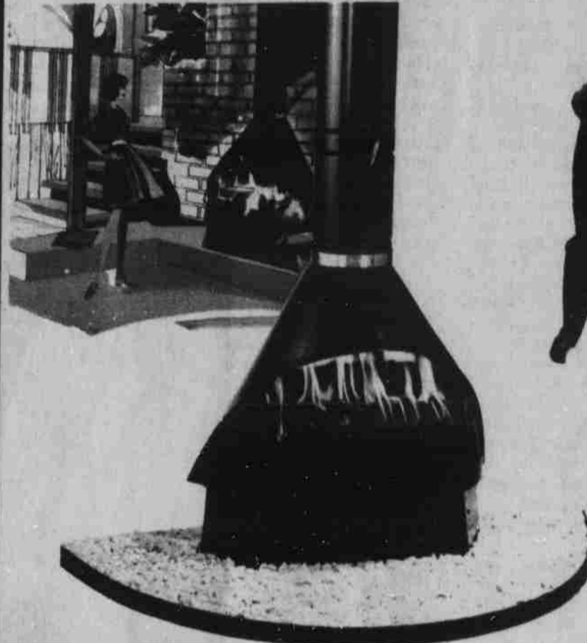
The CONTINENTAL FB 24