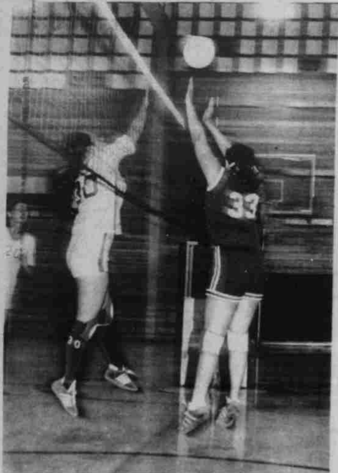
Ione and Heppner girls battled Tuesday.