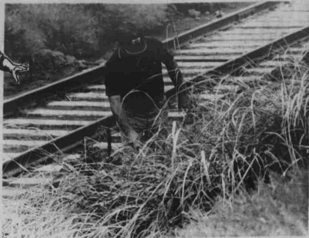
Dave Harrison found hazards more than once but managed to scramble to the green.