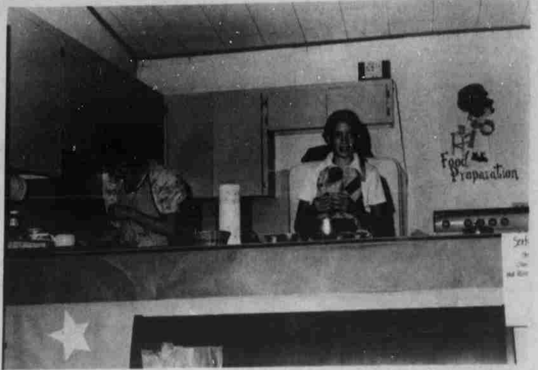
The 4-H food preparation begins at 9 a.m. Wednesday and goes all day.