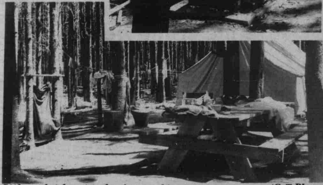
Girls cook (above) and enjoy sunshine.