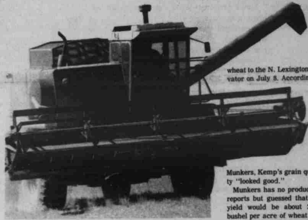
Stan Kemp heads for the next strip of wheat.