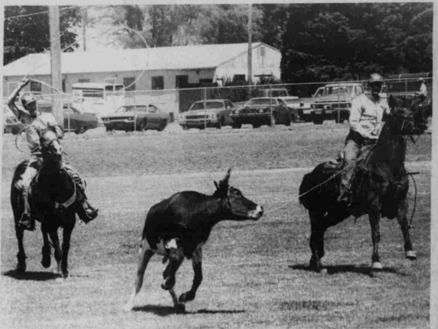
Team roping all afternoon

The day started early with a breakfast at Heppner City Park. More than 300 enjoyed the bicentennial breakfast of ham, eggs and hotcakes. The American Legion and Legion Auxiliary put the breakfast on.