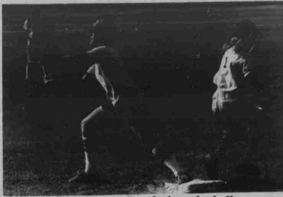
Skampering to first before the ball.