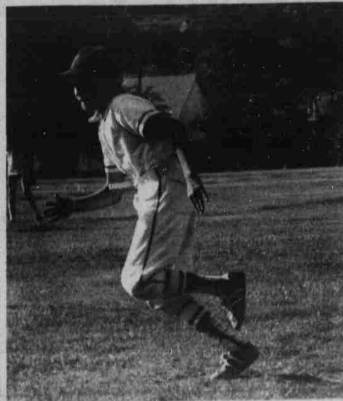
On the ground means I have to run.