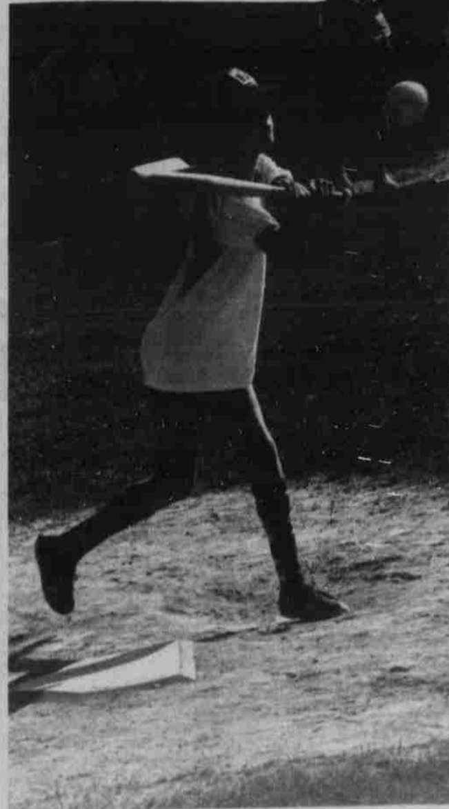
A good pitch . . . and a hit.