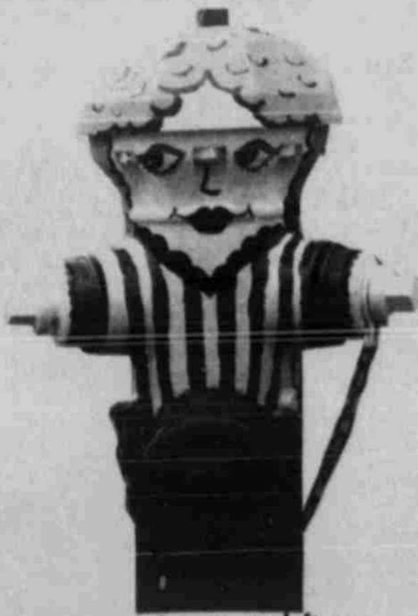
Bi-Centennial painted fire hydrants readying for July 4.