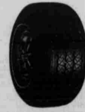
SEIBERLING RT 78 STEEL RADIAL

Custom Retreads RV & Commercial tires Wheels Warranty Policy