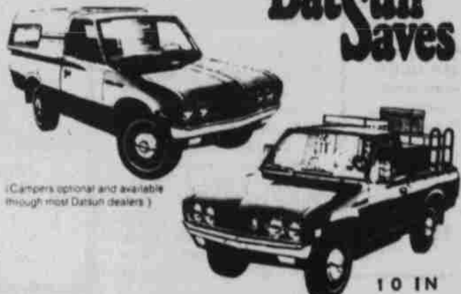
(Campers optional and available through most Datsun dealers.)