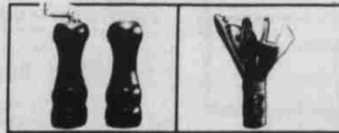
Adjustable pepper grinder and matching salt shaker by Catalina - 10 yr. guarantee