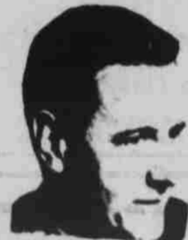
WILD BILL MARSHNER: