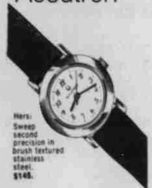
Here's Sweep second precision in brush textured stainless steel. $145.

Give something special. Bulova Accutron®