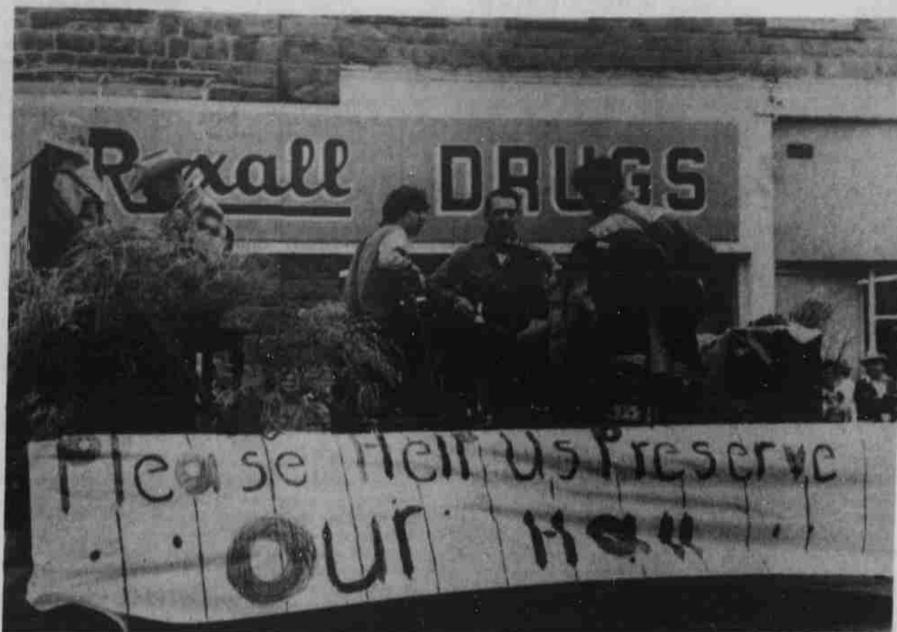
The Hardman Opry House float, entered for the first time in the Heppner parade.