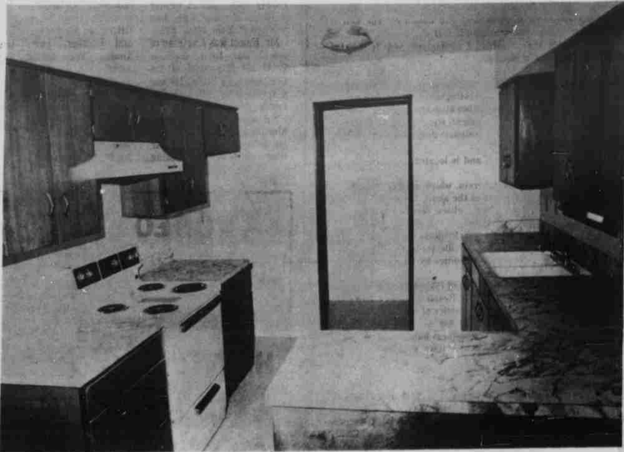
VIEW OF a modern kitchen in one of the five homes completed in Valley View Estates.