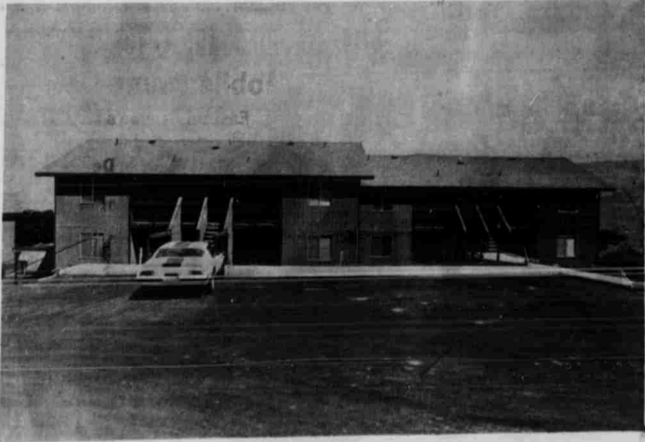
ONE OF THE three Evergreen Terrace apartment units.