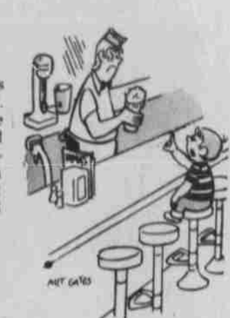
"No foam, please!"

Agerholm. During the seven-month cruise, he participated in training exercises with units of the U.S. Seventh Fleet, and visited the Phillippines, Hong Kong, Guam, Singapore and Pearl Harbor