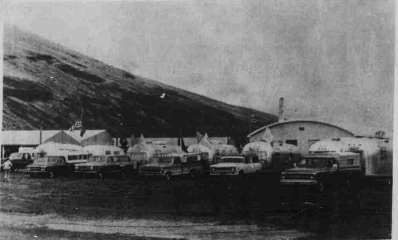
PART OF THE CARAVAN OF AIR STREAM TRAILERS from Eastern Oregon that held their rally at the Morrow County Fairgrounds last week. The group held a breakfast and potluck dinner during their visit. It is anticipated that other rallies will be held here in the future. There were approximately 16 trailers in the caravan.

The original March 1 deadline for first aid was set back two months as qualified first aid instructors throughout the state were swamped with employer requests. Other factors influencing the rollback were complaints from numerous employers and employer groups concerning details about the regulations.