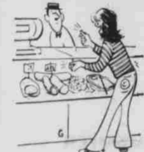
"A half-a-pound of cool cuts!"

The wedding will take place this summer, on August 16.