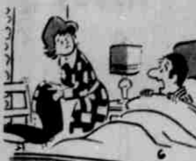
"To think I once asked for that hand in marriage!"

Any interested person or parent is welcome to attend. The association is seeking more children for the swim team.