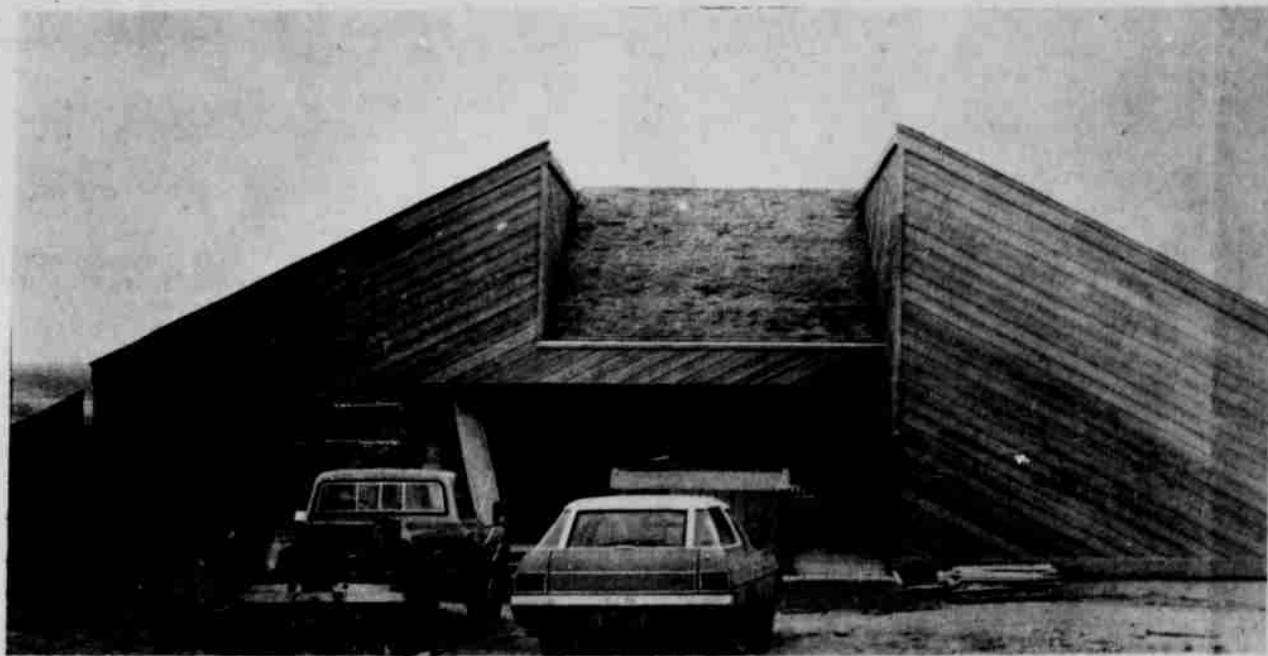
KINZUA'S UNIQUE headquarters are shown in the final stages of construction.