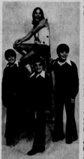
The Country Bugs

This is a community service advertisement brought to you by